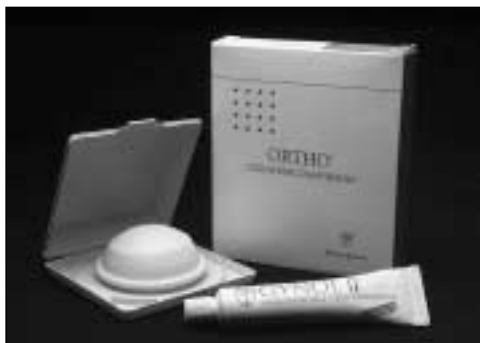
Figure 2. Diaphragm

Before a woman can successfully use the diaphragm or cervical cap, she will require detailed instructions for insertion, the opportunity to practise, and reassurance from the clinician. Reinforcement of the correct procedures is valuable, as are tips to becoming more comfortable with one's body. Providing information about the menstrual cycle will help women use their barrier method more effectively. Providing information