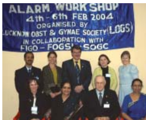
ALARM International Faculty, Lucknow, India