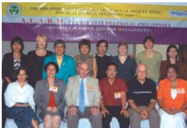
ALARM International Faculty, Manila, Philippines