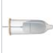
Sexually Transmitted Infections