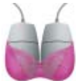
Women's Sexual Health