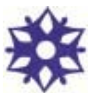
National Tay- Sachs and Allied Diseases of Ontario