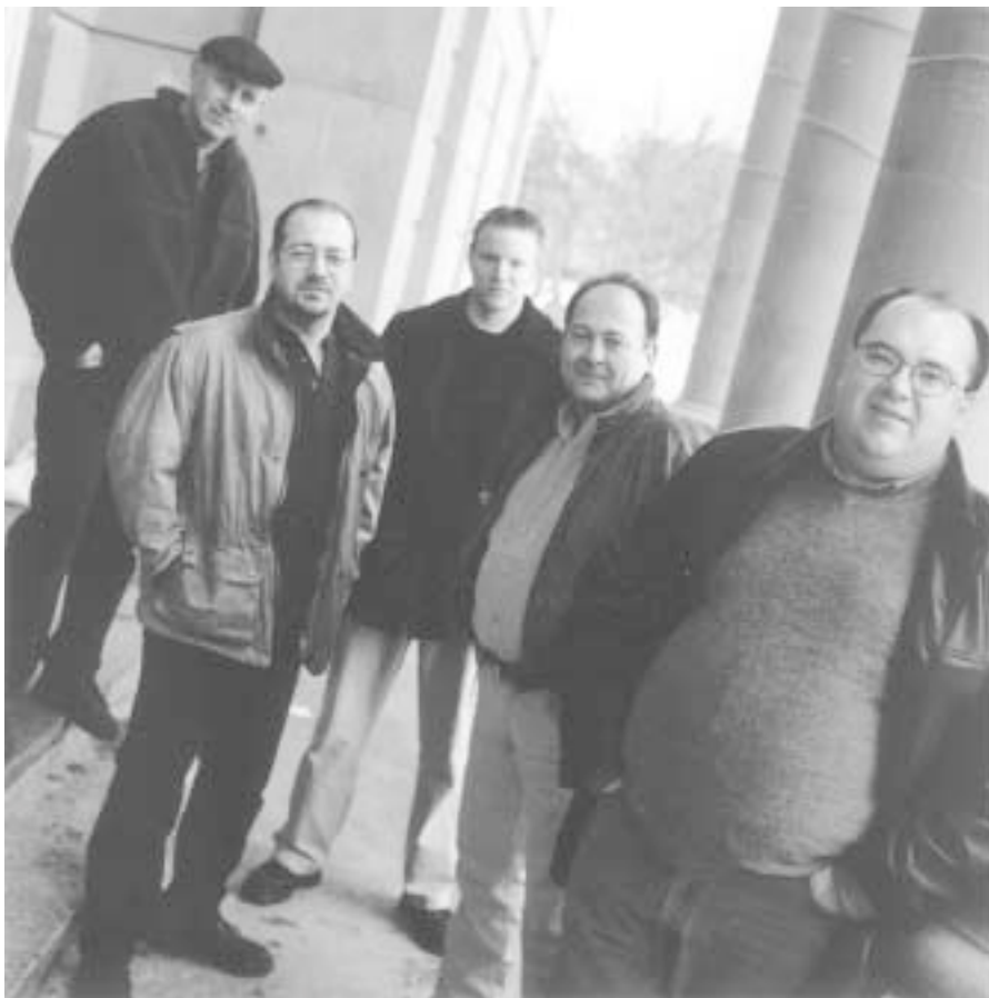
The Irish Descendants

The Foundation would like to thank you in advance for registering and participating in the above activities.