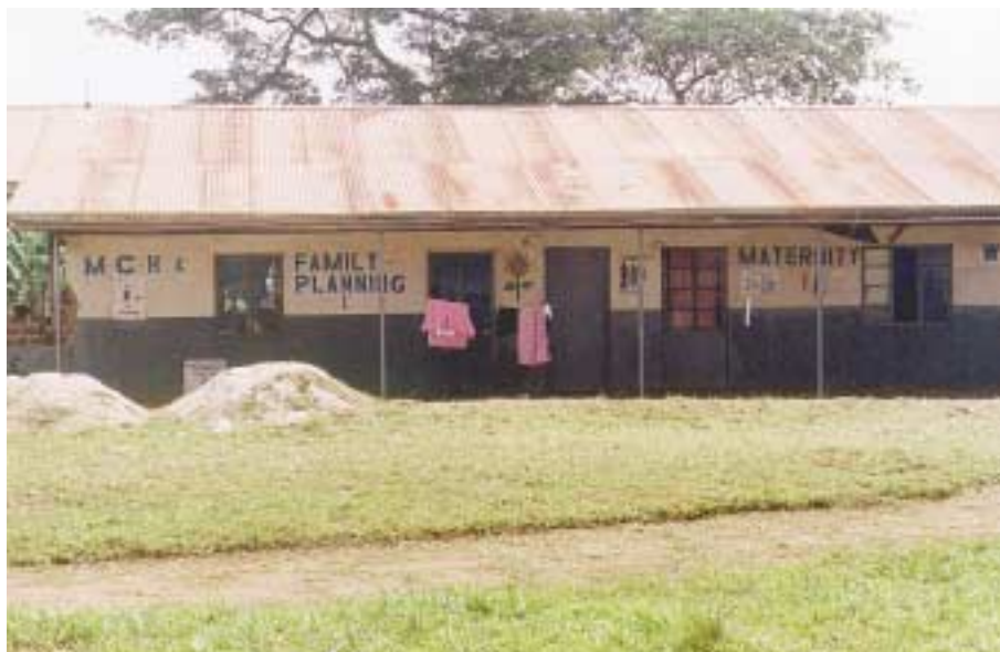
Clinic at Bukumero